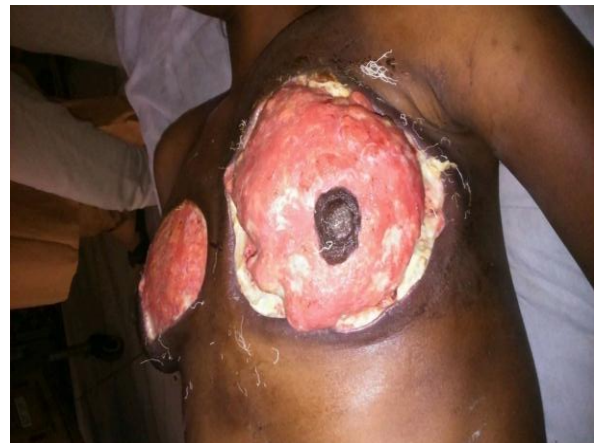
Figure 1: Before ayurvedic treatment.

Thus using the basic principles in Ayurved as mentioned earlier, this case was successfully completely healed. The most conspicuous fact is that there was no recurrence in last 7 years.