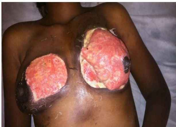
Fig. no. 2: After 15 days of ayurvedic treatment.