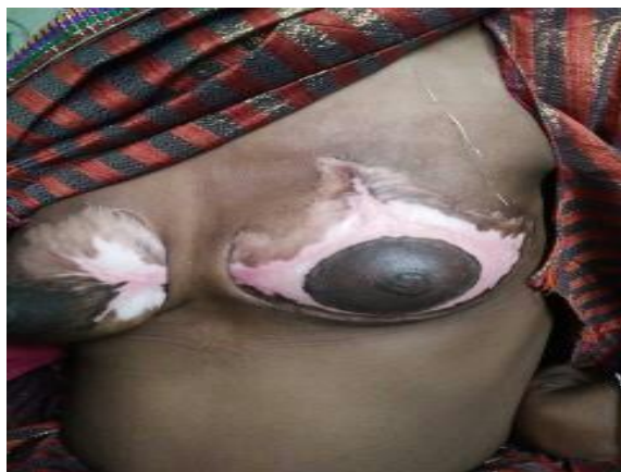
Fig. no. 4: Complete healing within 100 days.